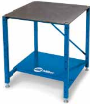
30S (951 167)

Tabletop style 3/16-in solid tabletop Weight 123 lb (56 kg) Dimensions 30 x 30 in (35 x 29 x 29 in)