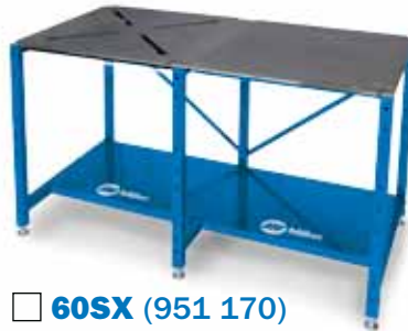
60SX (951 170)

Tabletop style 3/16-in solid tabletop Weight 230 lb (104 kg) Dimensions 30 x 60 in (35 x 58 x 29 in)