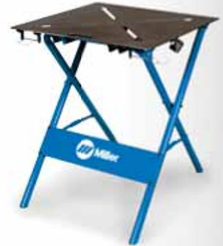
30FX (300 837)

Tabletop style 3/16-in X-pattern tabletop Weight 74 lb (34 kg) Dimensions 30 x 30 in (35 x 29 x 35 in unfolded, 6 x 29 x 48 in folded)