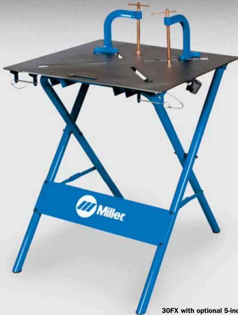
30FX with optional 5-inch X-clamps