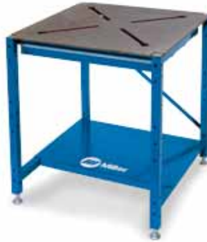
30SX (951 168)

Tabletop style 3/16-in solid tabletop Weight 123 lb (56 kg) Dimensions 30 x 30 in (35 x 29 x 29 in)