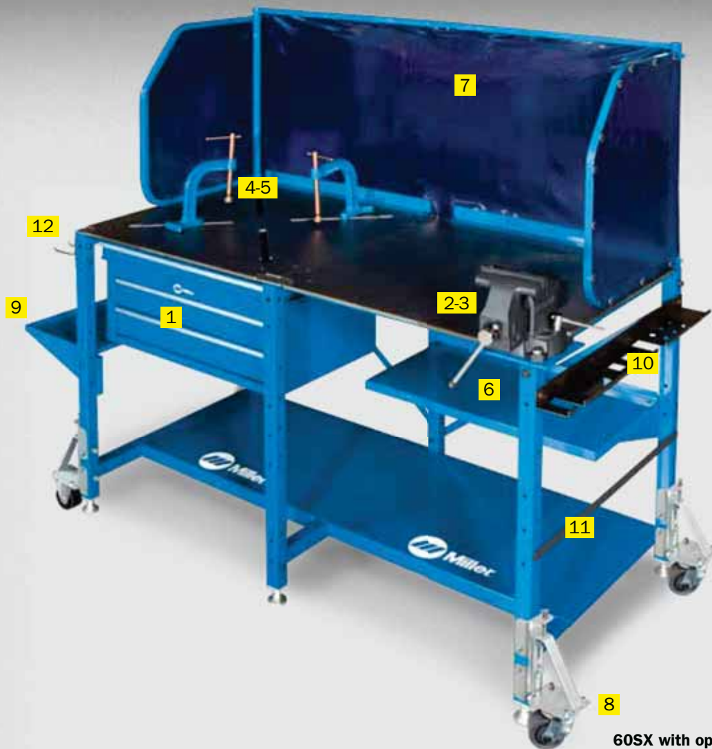
60SX with optional accessories