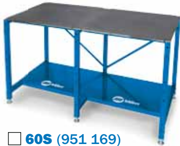
60S (951 169)

Tabletop style 3/8-in X-pattern tabletop Weight 177 lb (80 kg) Dimensions 30 x 30 in (35 x 29 x 29 in)