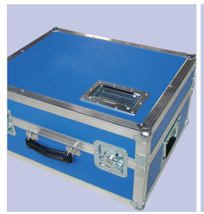
Including durable storage and shipping case