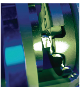
Burr-free and square