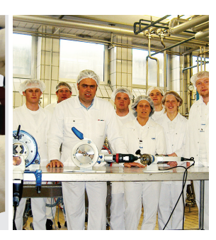
Application area: Process plant builders for the high-purity gas, electronic, pharmaceutical, food, beverage, solar as well as the chemical industry