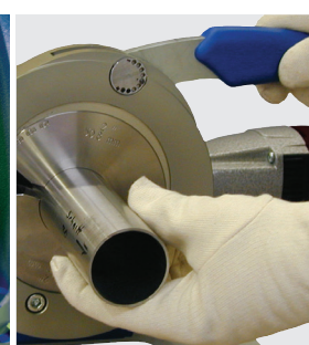
Quick clamping system for tools, clamping shells and tubes