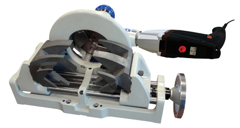
RPG 4.5 S