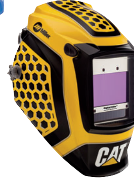
CAT Cat® Edition 1 281006