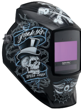
Lucky's Speed Shop™ 281001